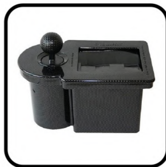
Club & Ball Washer