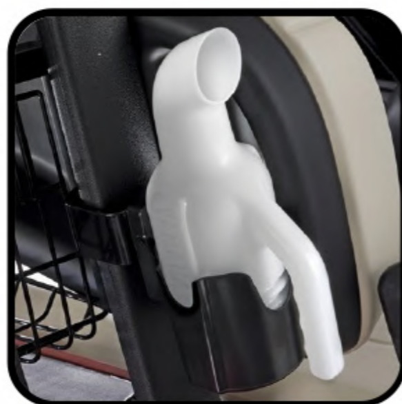
Sand Bottle Kit